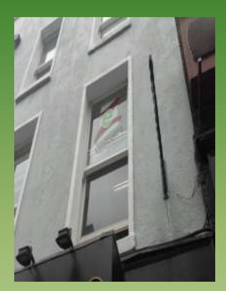
The entrance of my office

Working with my collegues at the reception