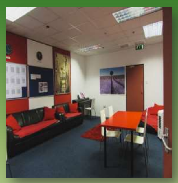
The Students' lounge, where pupils can relax or take a break between lessons.

The Reception, where students are welcomed by the receptionists, and where i've been working during all my internship.