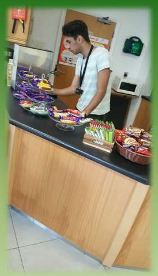
Managing and cleaning the canteen