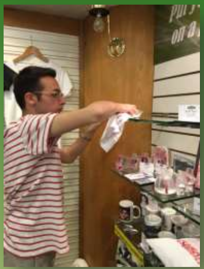
Cleaning shelves and insignias