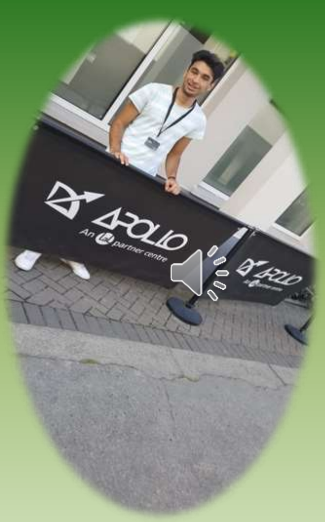
I worked in Apollo Language Centre, a private english school based in Dublin 2.