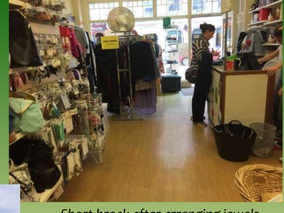
Short break after arrenging jewels