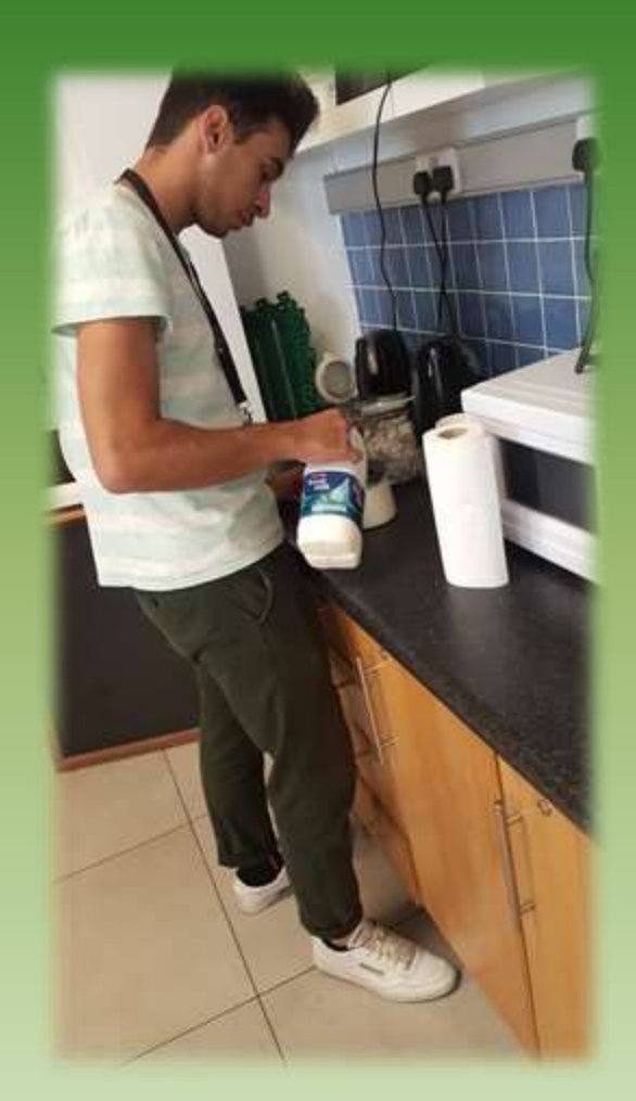
Pouring milk in a cup