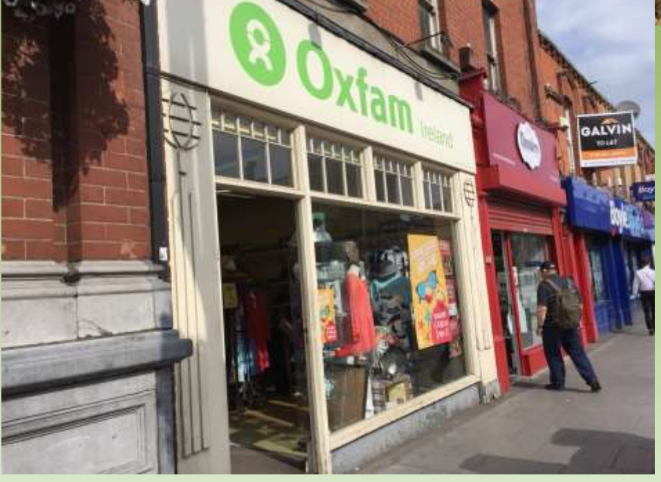
First day of work