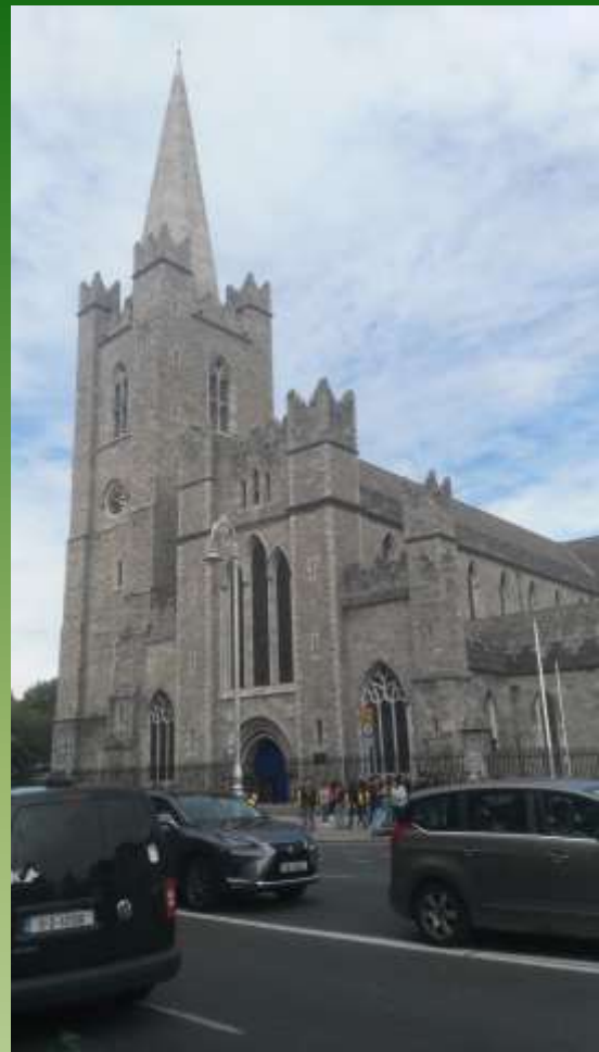
St. Patrick Cathedral