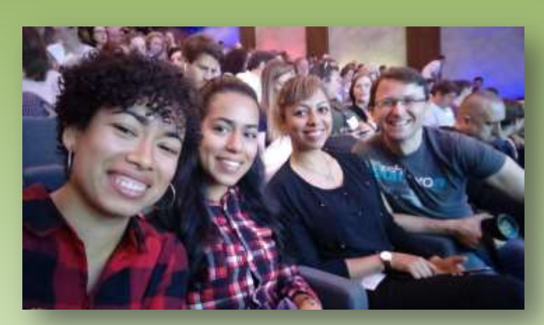
Breakfast Briefing at Google